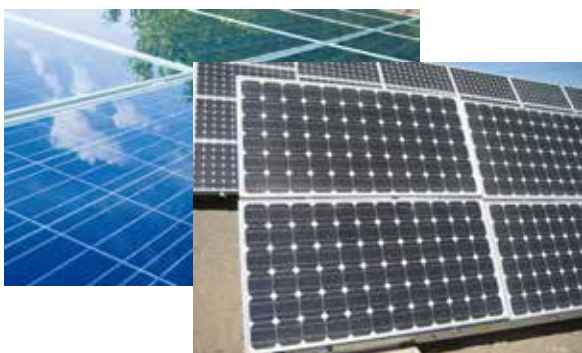
Figure 1 Japan is a leading producer of solar energy